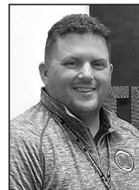
Enos Bacon Middle School Principal

Please contact me or our staff if you have any questions. We look forward to working with you as we prepare your students for the rigors of high school and beyond.